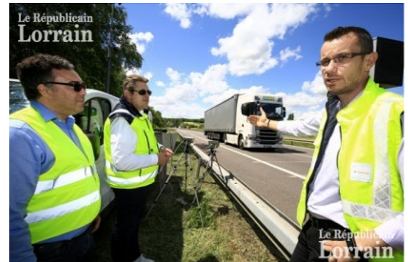
Testing of WIM on A4 Highway (France)