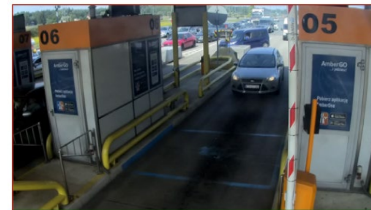
Video Tolling on A1 (Poland)