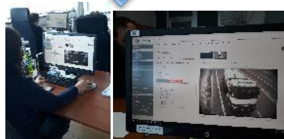
Enforcement back office