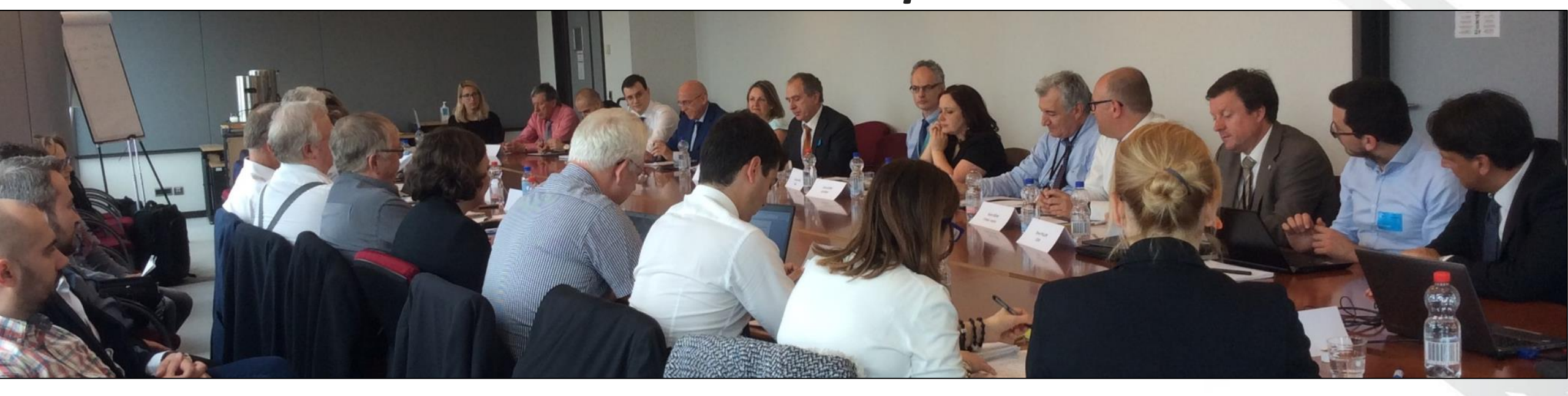
Wednesday 16th of May 2018 – European Parliament

"How the European ITS platform and ITS corridors can facilitate the large-scale deployment of safe mobility services in Europe?